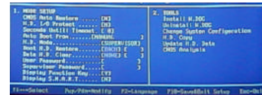
Figure 7: WatchDog Setup Menu

After installation of the 32-bit driver, system will boot to WatchDog Startup Menu as shown in Figure 5. Press <F10> and access the WatchDog Setup Menu as shown in Figure 7.