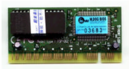
Figure 1: WatchDog System Recovery Card

To install the recovery card, simply plug it into an available PCI slot. Make sure the card is plug in all the way for all power and ground circuit are at the PCI slot. Failure to do so might result in damage to the Card. WatchDog System Recovery Card requires a ROM address for its function. In this new PCI version, the PnP BIOS will automatically select proper ROM address for WatchDog usage. Put back the cover to the system when done.