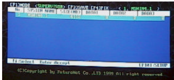
Figure 5: WatchDog Startup Menu

After select Option #1, WatchDog will start to configure for your system, you will boot to WatchDog Startup Menu here after several reboots. System will stop at the WatchDog Startup Menu: