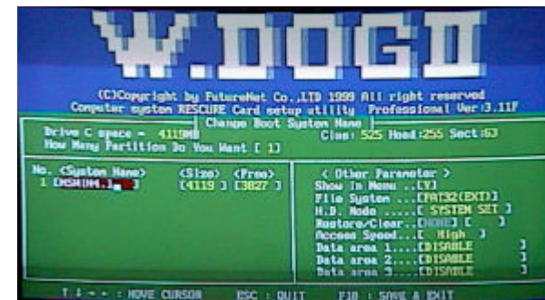
Figure 8: WatchDog Partition Setup Menu

Select Update H. D. Data to make sure all protected data are current. Then, select “Change System Configurations” to access the WatchDog Partition Setup